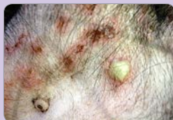
Secondary bacterial infection (pyoderma)