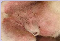
Red skin (Erythema)