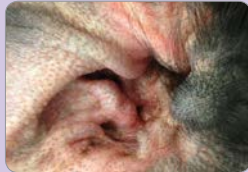
Ear infection (Otitis Externa)